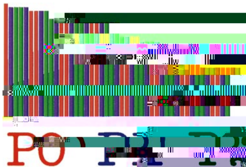
FIG. 2. Distribution of g vector columns to three processors. The g vector columns are produced by dividing the sphere of g vectors into z direction columns (see Fig. 3a). The columns are then ordered by length and assigned to the three processors as shown, with processor zero being assigned all the red columns, processor one the blue columns, and processor two the green columns.